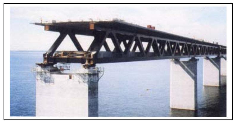
FLOATING CRANE SVANEN AND A PART OF INSTALLED SPANS OF AN APPROACH BRIDGE.